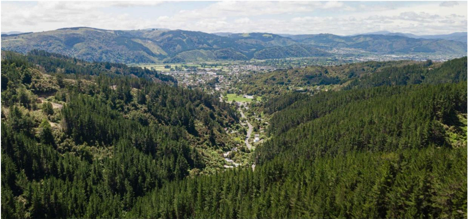
Silverstream Forest could one day be developed for 1600 houses.